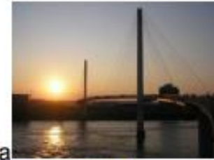
Bob Kerrey Pedestrian Bridge, Omaha

The Omaha bridge is the longest in the country connecting two states.