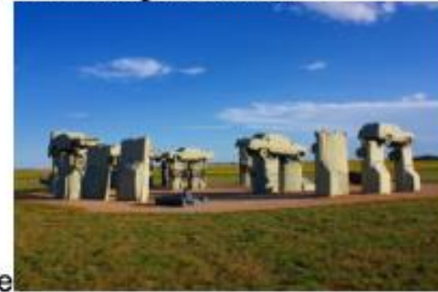
Carhenge , Alliance Chevyland U.S.A. Auto Museum , Elm Creek

This replica of England's Stonehenge is made entirely of cars.